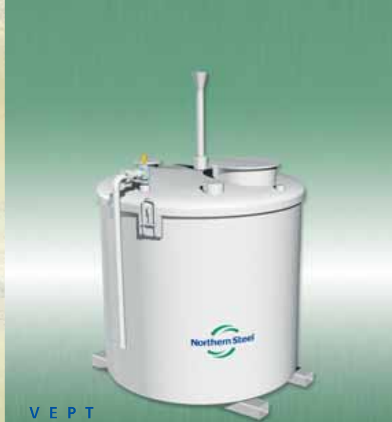
V E P T

Northern Steel's API-12F Shop Fabricated vertical storage tanks provide versatile, economical storage solutions. These tanks may be used individually, or may be tied together in batteries depending on the specific site requirements.