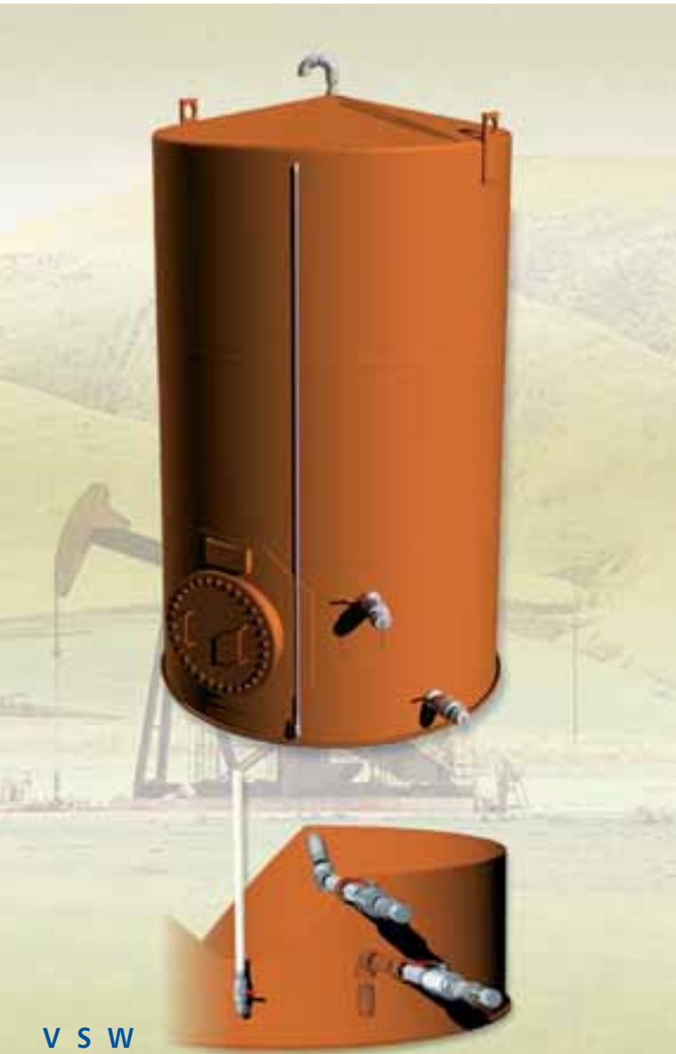
V S W

The VEPT (Vertical Environmental Protection Tank) from Northern Steel provides convenient above ground storage for smaller volume applications. The double wall construction ensures maximum risk management for virtually any liquid. Secondary containment has 110% capacity of the primary tank and is continuously vented to the atmosphere.